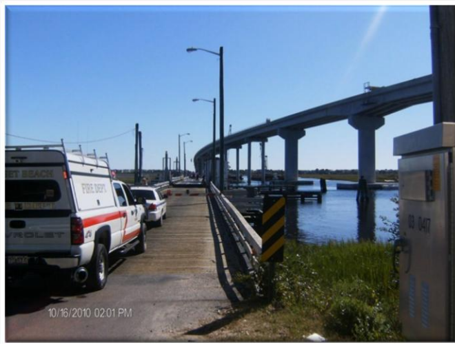
The new meets the old